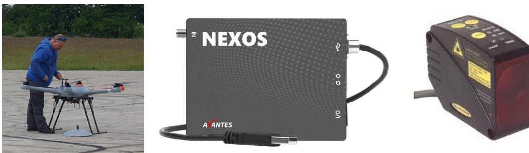
Figure 1. System components, from left to right: hexacopter drone, compact fiber optic spectrometer, laser distance meter